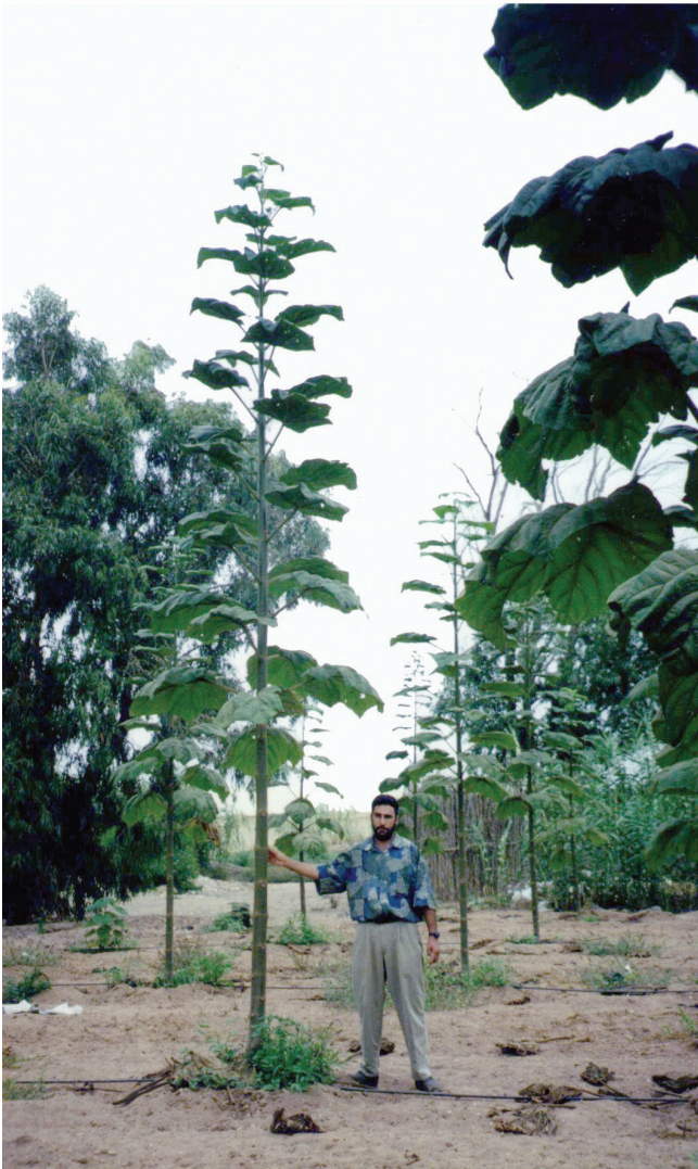
September 1999. The melon has been removed and the Paulownia is now several meters in height.