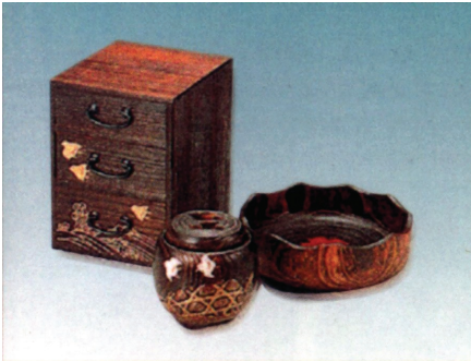
Figure 10: Some handicrafts made from Paulownia.