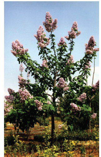
Figure 2: A Paulownia tree in bloom. This is an ornamental variety; the open canopy is not suitable for timber production.

It was introduced into the United States in the 1800s when Paulownia seeds, which had been used as packing material for Chinese dinnerware, were released into the wild, where they flourished. These feral Paulownia growths were discovered by the Japanese in the 1970s and have since become the focus of a multi-billion dollar export project.