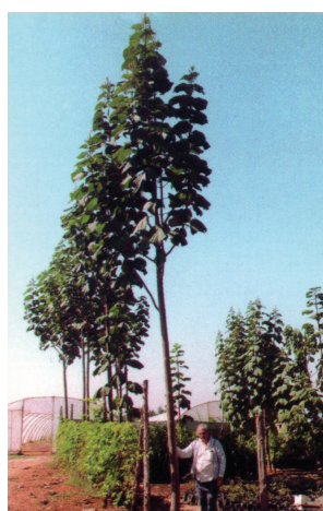
Figure 4: A one year old tree in our nursery.

The Paulownia tree is extremely hardy; it has a broad range of temperature tolerance and has been known to grow at altitudes of up to 2,000m. Under optimal conditions, a 5-6m increase in height can be expected in the first growing season and an increment of 3-4cm in diameter at breast height annually. Trunk extension in Paulownia is sympodial; the rapid growth of the lateral branches, however, gives it the appearance of a monopodial growth pattern.