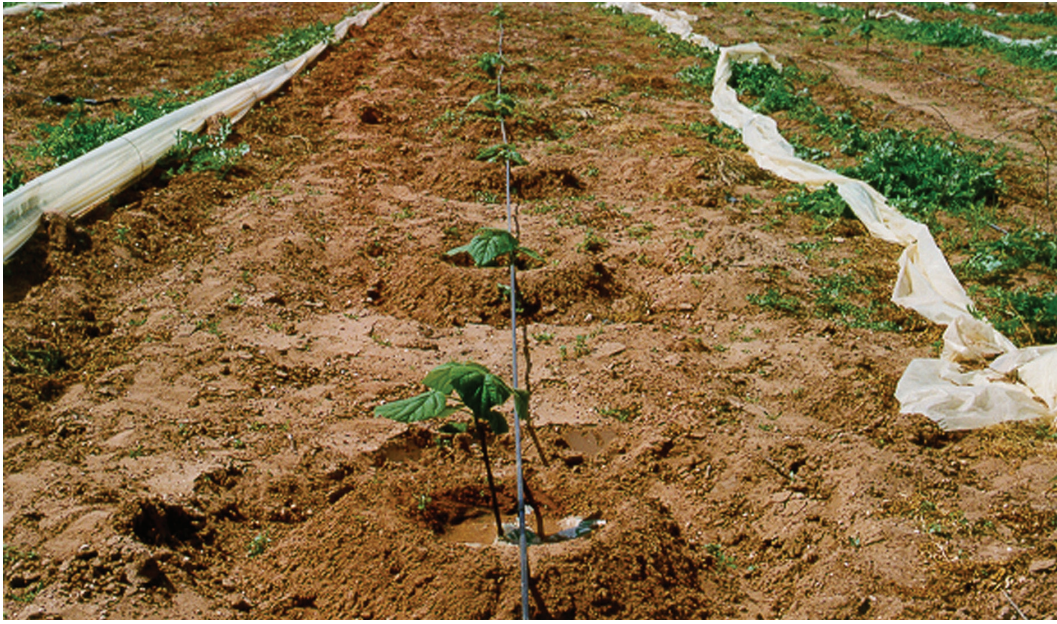
March 1999. Paulwonia and melon being planted.