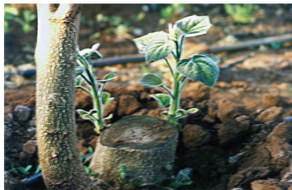
Figure 7: A coppiced trunk with new shoots.

Coppicing is the process of cutting a tree back to ground level in order to promote the formation of a new shoot. Paulownia is a prolific shooter; it is therefore recommended that trees be coppiced, preferably during the second year. Trees should be coppiced in the late spring, just before the beginning of the growing season. Short trunked seedlings or seedlings with poorly formed trunks should be cut just above the third bud during spring of the second year, just before the emergence of new leaves; a new, straight, well-formed trunk will shoot from the lower buds. Allow several of the buds to grow out before selecting the best one.