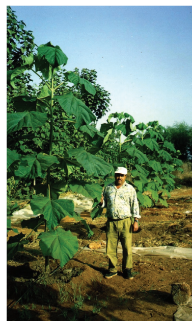
Figure 9: Two month old Paulownia. Note the large leaves that form during the first year.

Source: Leaf analysis by Industry Institue