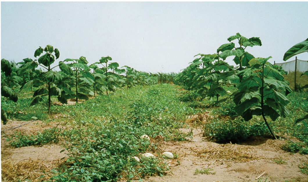
June 1999. Paulownia being intercropped with melon.