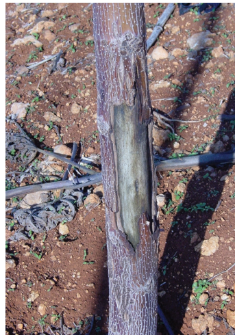
Figure 6: Grazing damage to trunk.

Paulownia can survive between latitudes 40°N and 40°S and at altitudes of up to 2,000m. Although the tree can withstand temperatures between -20°C and +40°C, optimal conditions for growth are between 24°C and 29°C. In regions where there is a significant seasonal variation in temperature, it is advisable to wrap young trees in grass during the winter (to protect the bark from freeze-damage) and to paint them during the summer (to protect the bark from sun-scald). Young Paulownia trees are very tall but may not have yet developed an extensive root system to provide anchorage; strong winds can cause breakage or inclined stems, which should be straightened out, propped and mounded.