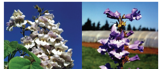
Figure 3: Paulownia flowers. Flower color varies with variety; the range is from light to dark purple.

Paulownia is a fast-growing deciduous hardwood with gray-brown lenticillate bark. The leaves have long petioles and an opposite arrangement; juvenile leaves can be as large as 80cm, with a serrate margin, while mature leaves are smaller and have a smooth, wavy margin. The undersurface of the leaves is covered with a dense layer of fine hairs. The inflorescence is a pedunculate or sessile cyme of 2-5 flowers; the fragrant, purplish white flowers have a large, two-lipped corolla, with two lobes on the upper lip and three on the lower. Paulownia is entomophilous and can be cross-pollinated to produce numerous small, ellipsoid, membranaceous seeds with striate wings.