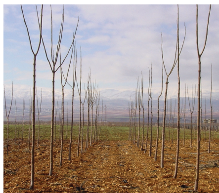
Figure 8: Trees pruned in the growing season; only the crown branches remain in winter. Bekkaa Valley, Lebanon; December 2001.

Pruning should begin in the second or third year and should be performed throughout the growing season as new branches emerge. Unnecessary lateral branches should be removed; the branches of the crown, however, should not be cut during the year of their emergence, as they will form the sympodial extension of the trunk. Only the first 7-8 meters of the stem need to be kept clear of branches; after this the canopy can be allowed to assume its natural shape.