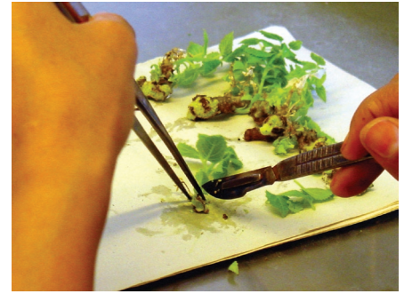
Figure 5: Working with Paulownia in vitro.

The use of in vitro propagation techniques provides a supply of healthy, homogenous planting material for Paulownia. Trees planted from seed often show an altered growth habit and may be more susceptible to pests and diseases. We use only primary and axillary shoot meristems as explants for our in vitro cultured Paulownia plants in order to ensure true clonal propagation. Our research has shown that the best growth is achieved when the composition of the growth medium is adjusted for both the variety and the stage of growth.